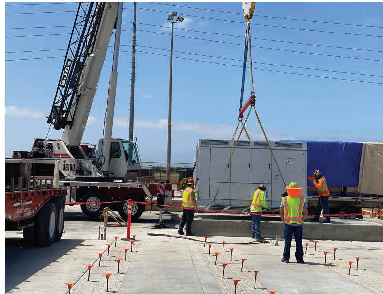
Construction of the Top Gun Energy Storage facility, which is expected to be operational in June 2021.

Where: The existing Palomar Energy Center in the City of