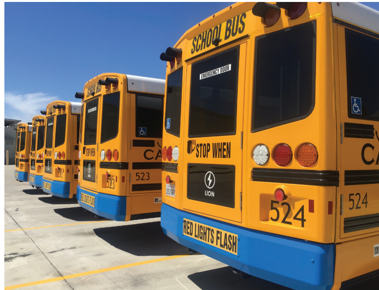
SDG&E is piloting vehicle-to-grid (V2G) technology with electric school buses at the Cajon Valley Union School District.

When: In March, SDG&E energized the first EV chargers built under Power Your Drive for Fleets. Expect to complete the program by end of 2026.