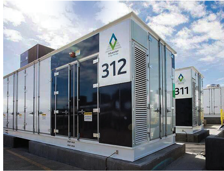
In 2017, SDG&E built what was then the largest lithium-ion battery (30MW/120MWh) in the City of Escondido.

When: Groundbreaking is imminent and completion expected in late 2021 / early 2022.