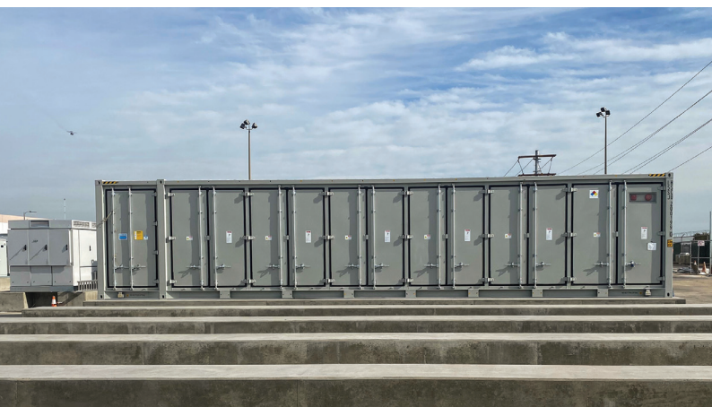
Top Gun Energy Storage is so named because it is located near Marine Corps Air Station Miramar, former home of the Top Gun naval aviation training program.

Where: Existing Miramar Energy Facility in the Miramar area of the City of San Diego