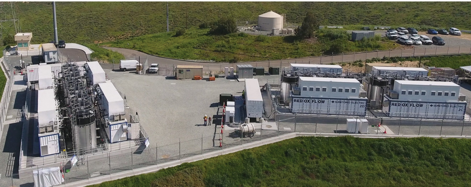
SDG&E's vanadium redox flow battery (2MW/8MWh) located in south San Diego County was the first battery of its kind to be connected to the CAISO market.